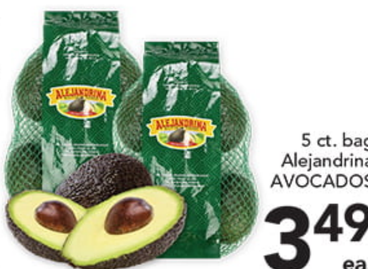
5 ct. bag Alejandrina AVOCADOS