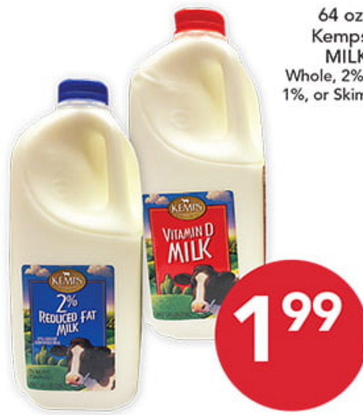
64 oz. Kemps MILK Whole, 2%, 1%, or Skim