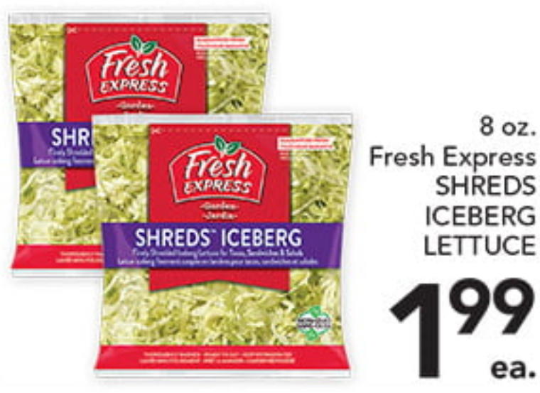
8 oz. Fresh Express SHREDS ICEBERG LETTUCE