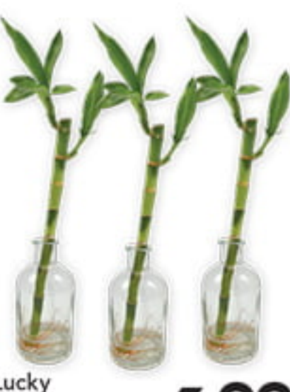
*Lucky BAMBOO PLANT with Vase

*Not available at all stores. While supplies last.