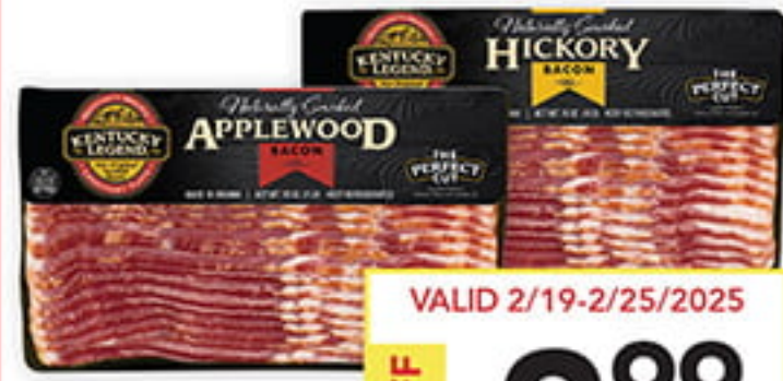
16 oz. Kentucky Legend SLICED BACON

2.99 EA Limit 1 | While supplies last Must use Digital Coupon