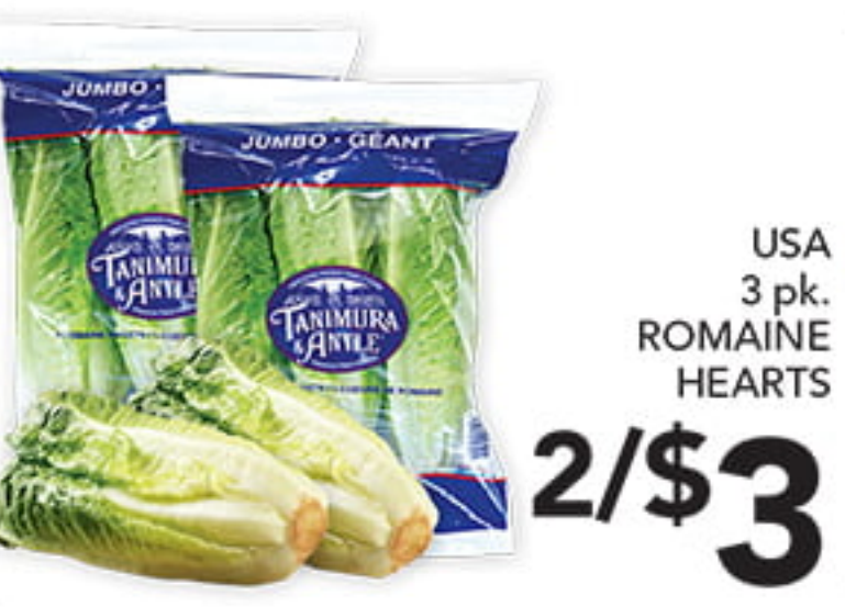
USA 3 pk. ROMAINE HEARTS