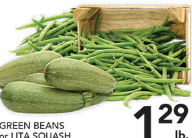
GREEN BEANS or LITA SQUASH