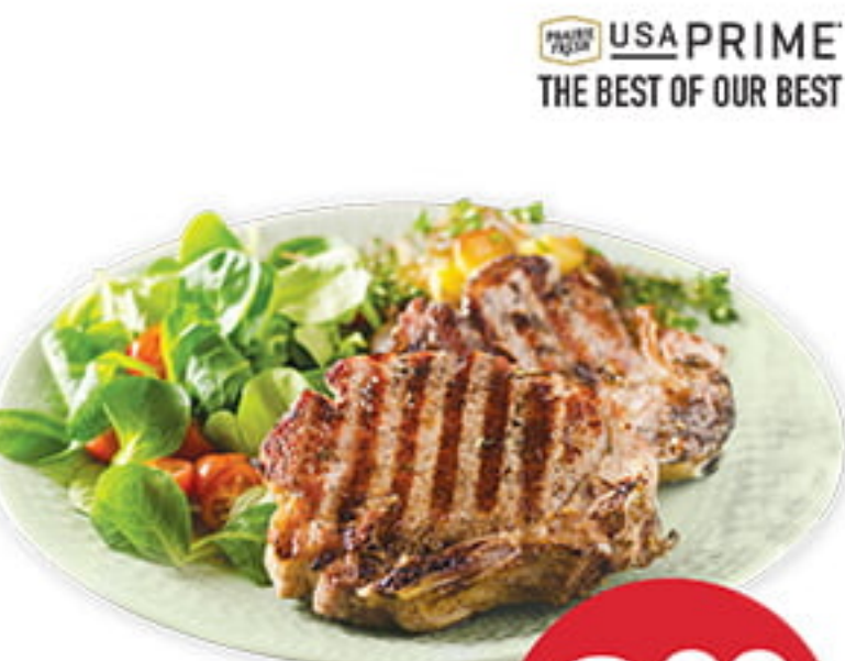
Prairie Fresh USA Prime Center Cut Bone-In PORK CHOPS Family Pack