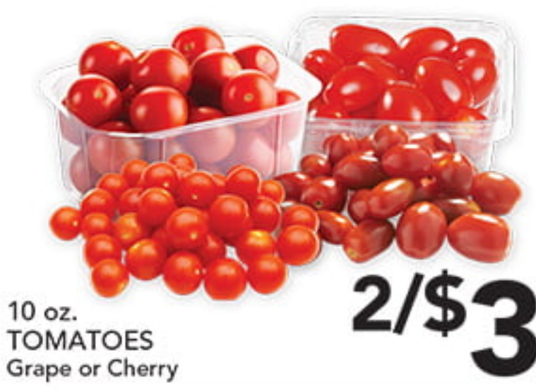
10 oz. TOMATOES Grape or Cherry