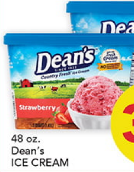
48 oz. Dean's ICE CREAM