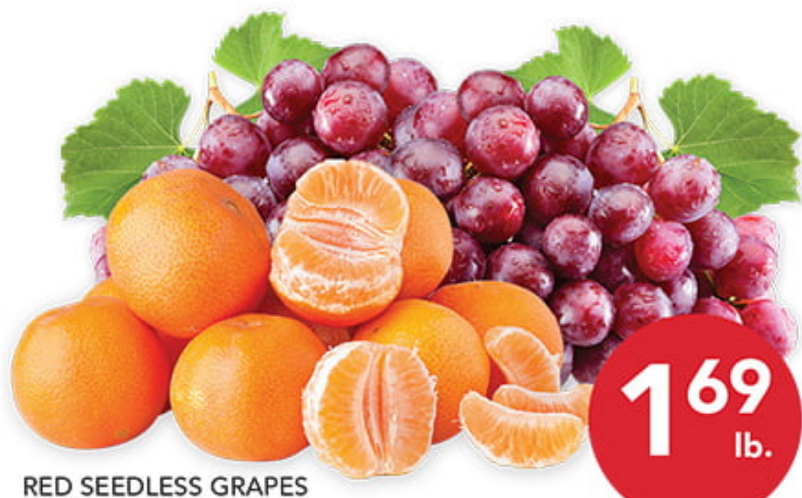
RED SEEDLESS GRAPES or LOOSE CLEMENTINES