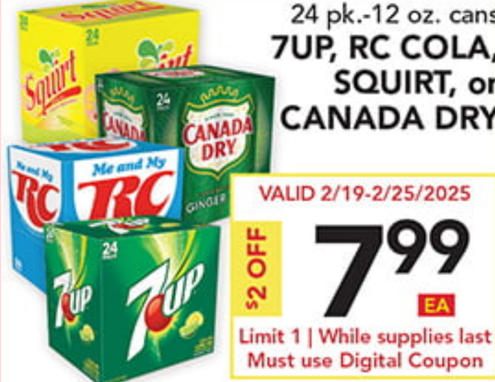
24 pk.-12 oz. cans 7UP, RC COLA, SQUIRT, or CANADA DRY

7.99 EA Limit 1 | While supplies last Must use Digital Coupon