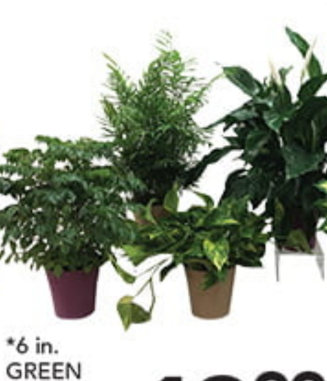
*6 in. GREEN INDOOR PLANTS Assorted