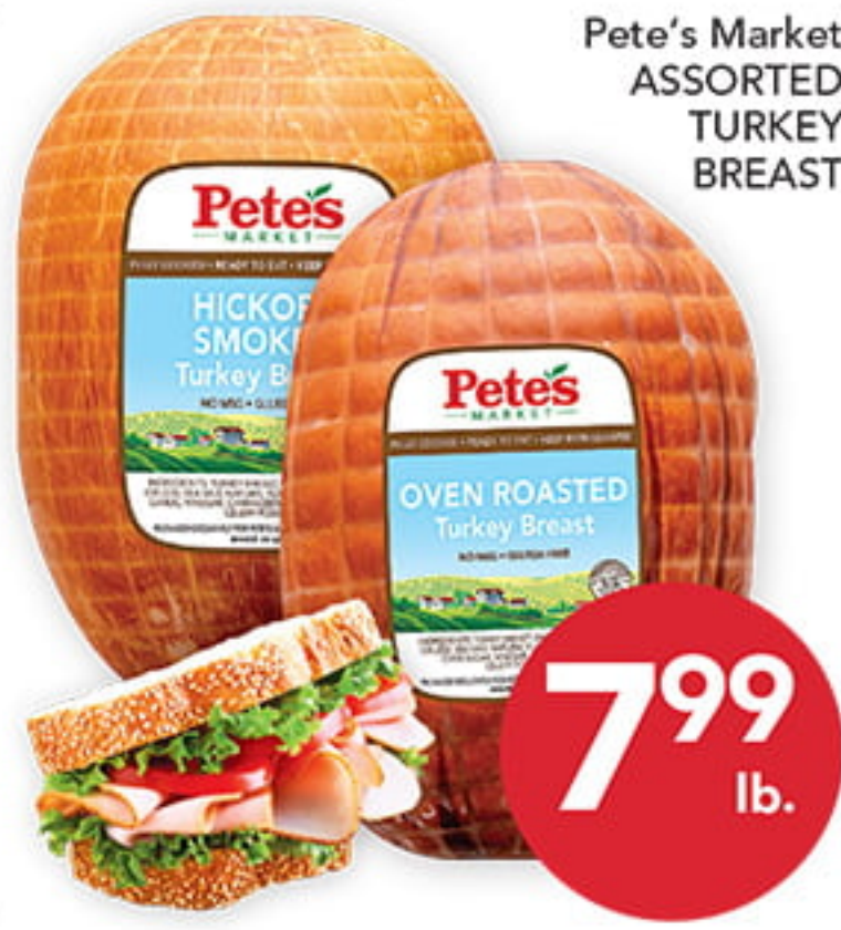
Pete's Market ASSORTED TURKEY BREAST