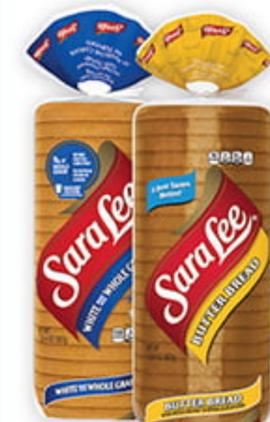
Sara Lee 20 oz. BREAD Whole Grain White, 100% Whole Wheat, Butter Bread, or Honey Wheat