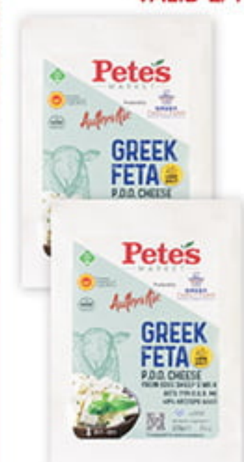
7 oz. pkg. Pete's Market Imported From Greece FETA CHEESE Regular or Low Sodium