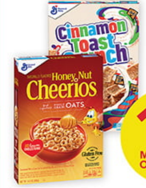
8.9-12 oz. General Mills CEREAL Select