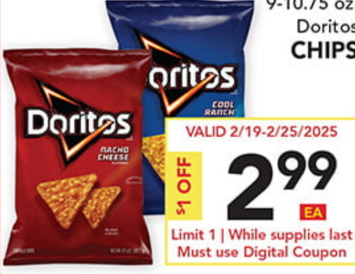
9-10.75 oz. Doritos CHIPS

2.99 EA Limit 1 | While supplies last Must use Digital Coupon