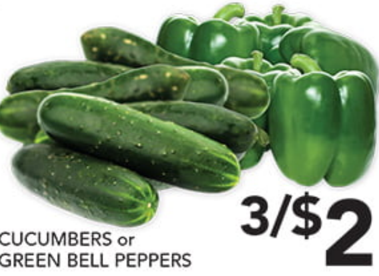
CUCUMBERS or GREEN BELL PEPPERS