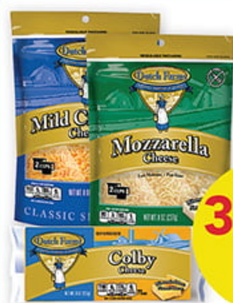
8 oz. Dutch Farms CHEESE Shredded or Chunk