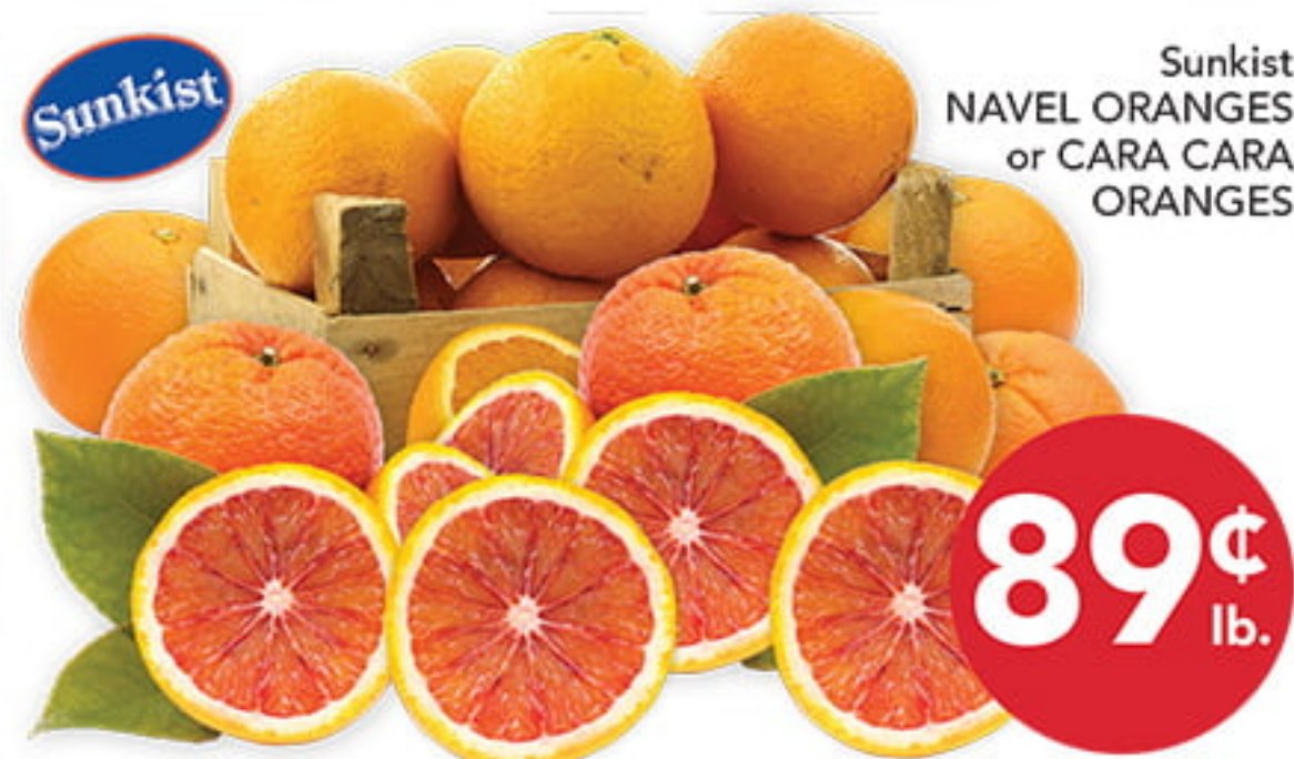
Sunkist NAVEL ORANGES or CARA CARA ORANGES