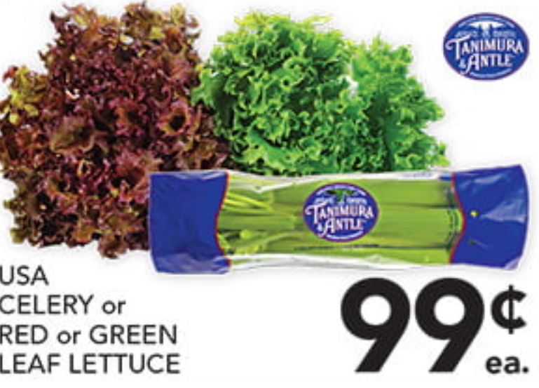
USA CELERY or RED or GREEN LEAF LETTUCE