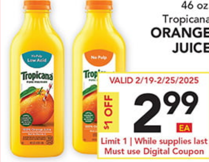
46 oz. Tropicana ORANGE JUICE

2.99 EA Limit 1 | While supplies last Must use Digital Coupon