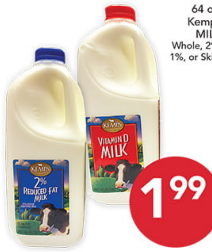
64 oz. Kemps MILK Whole, 2%, 1%, or Skim