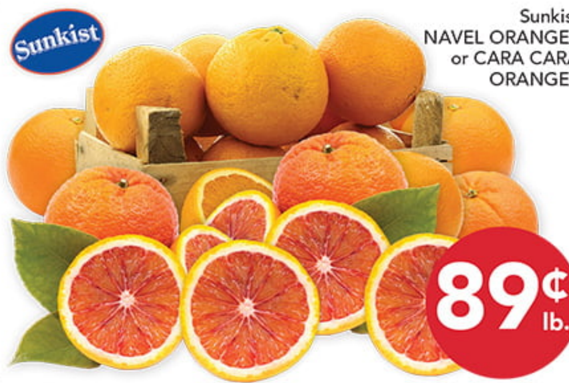
Sunkist NAVEL ORANGES or CARA CARA ORANGES