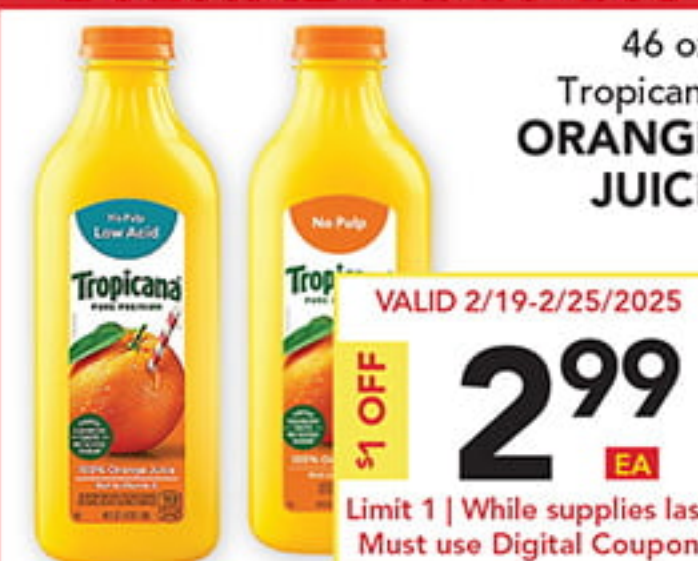
46 oz. Tropicana ORANGE JUICE