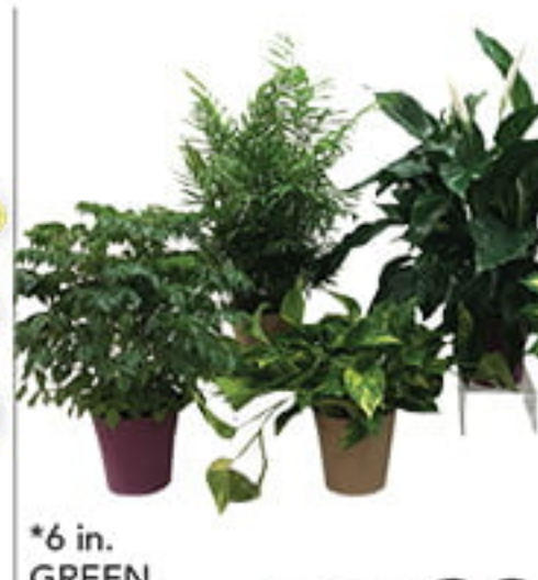
*6 in. GREEN INDOOR PLANTS Assorted