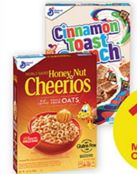
8.9-12 oz. General Mills CEREAL Select