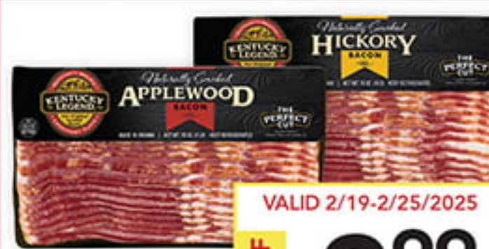
16 oz. Kentucky Legend SLICED BACON