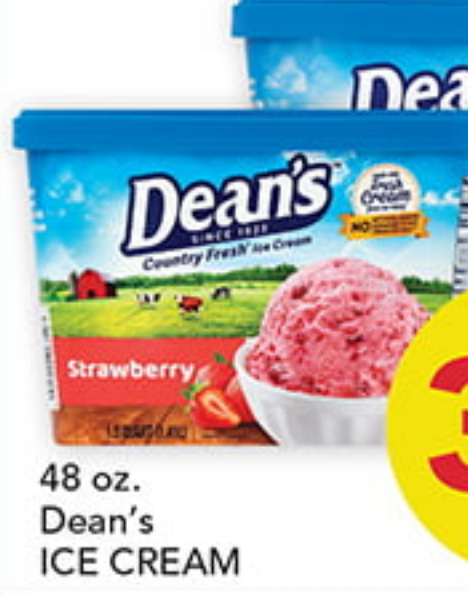
48 oz. Dean's ICE CREAM