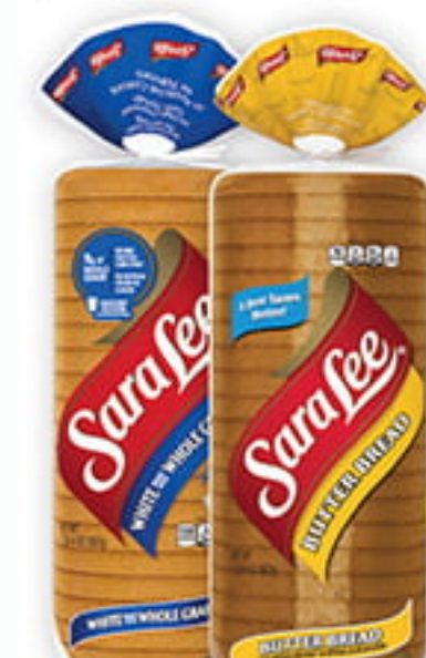
Sara Lee 20 oz. BREAD Whole Grain White, 100% Whole Wheat, Butter Bread, or Honey Wheat