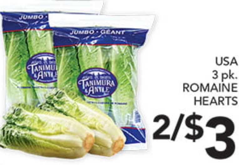
USA 3 pk. ROMAINE HEARTS