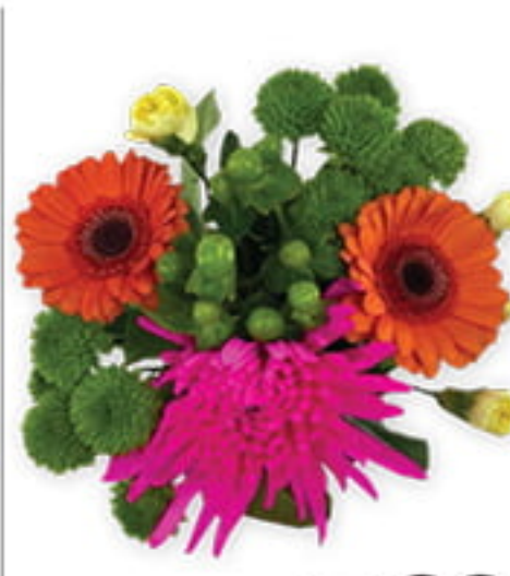
*Cheerful Day BOUQUET