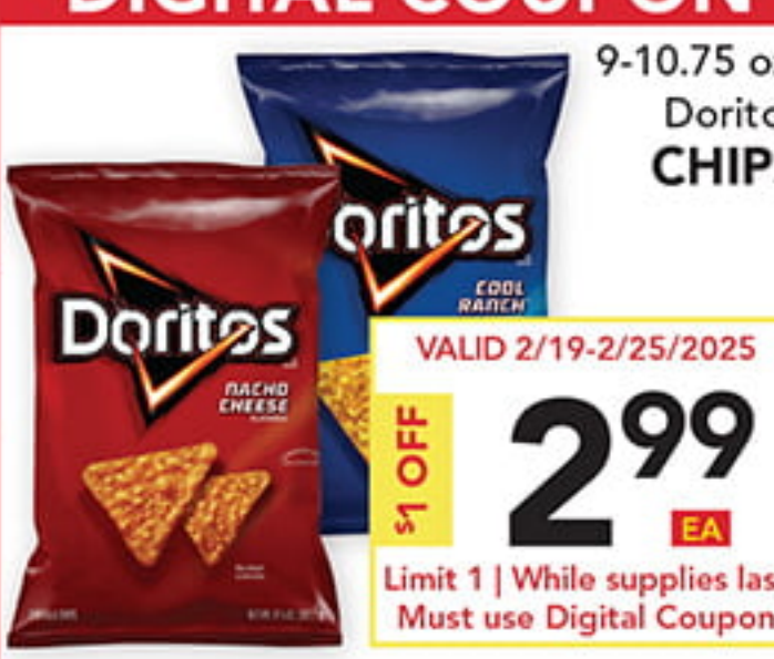
9-10.75 oz. Doritos CHIPS