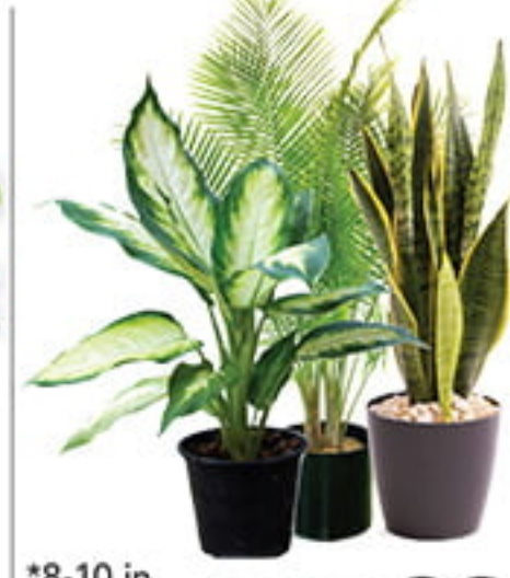
*8-10 in. TROPICAL PLANTS Assorted