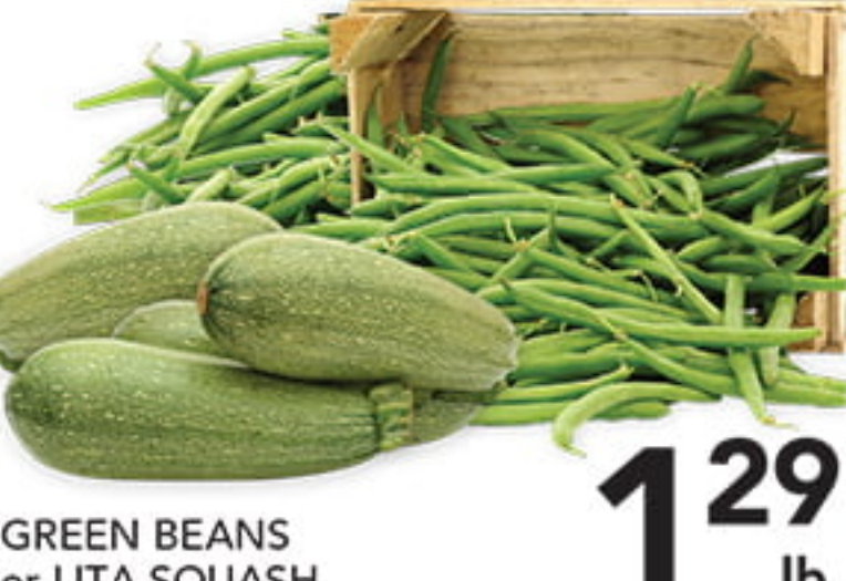
GREEN BEANS or LITA SQUASH