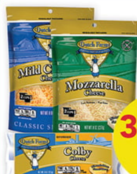
8 oz. Dutch Farms CHEESE Shredded or Chunk