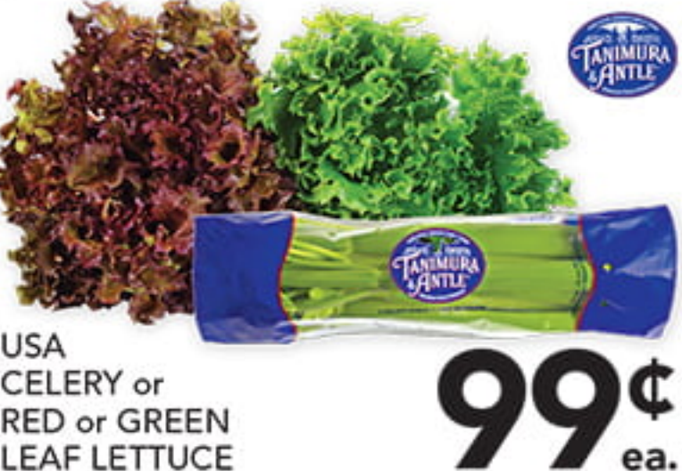
USA CELERY or RED or GREEN LEAF LETTUCE