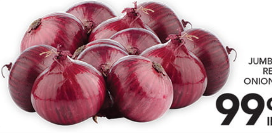
JUMBO RED ONIONS