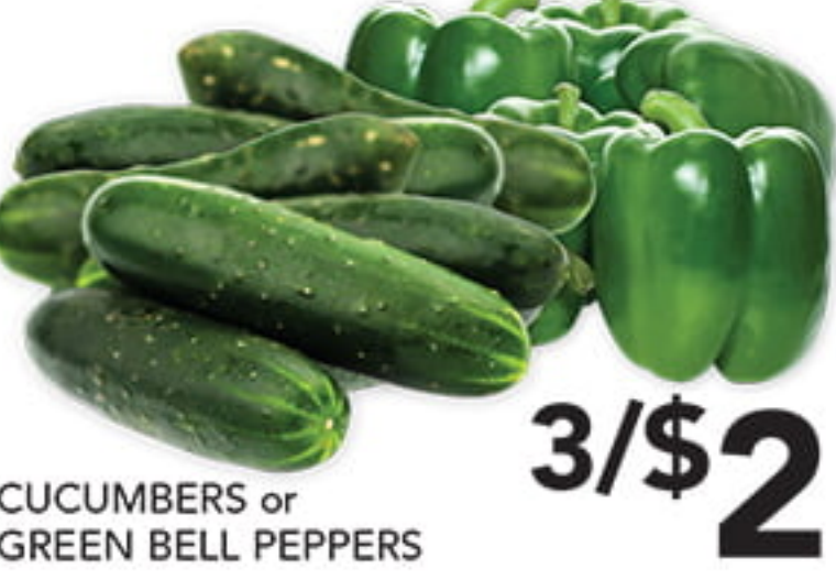
CUCUMBERS or GREEN BELL PEPPERS