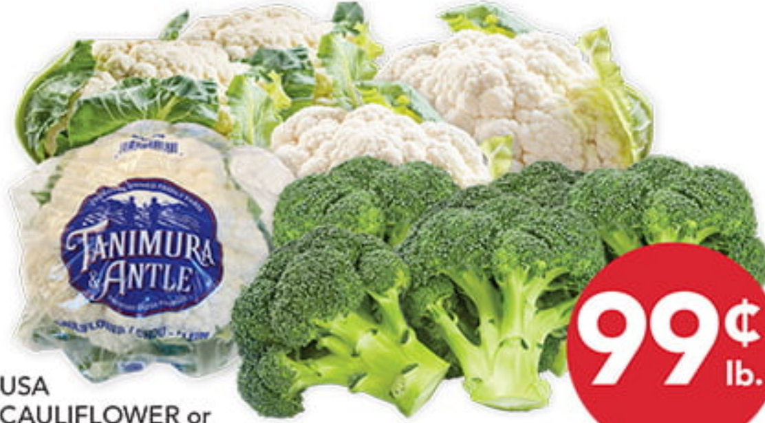
USA CAULIFLOWER or BROCCOLI CROWNS