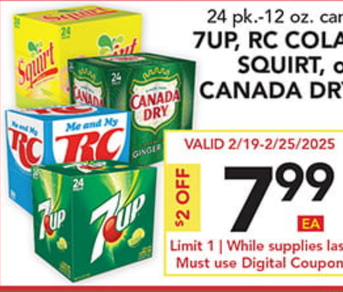
24 pk.-12 oz. cans 7UP, RC COLA, SQUIRT, or CANADA DRY