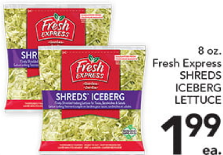
8 oz. Fresh EXPRESS SHREDS ICEBERG LETTUCE