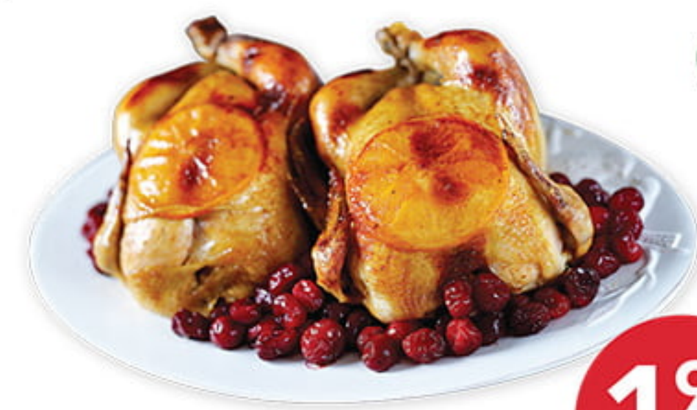
Halal Fresh YOUNG WHOLE FRYER CHICKEN Sold in Twin Pack