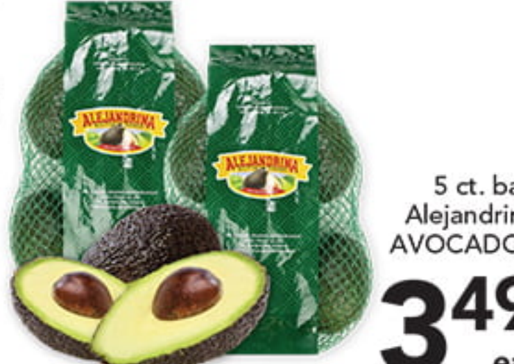
5 ct. bag Alejandrina AVOCADOS