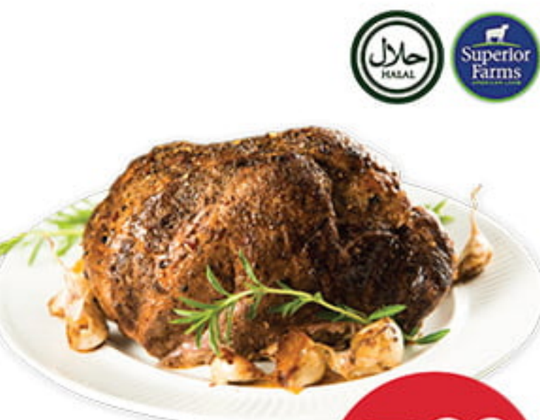
Halal USDA Choice American Colorado WHOLE LAMB SHOULDER