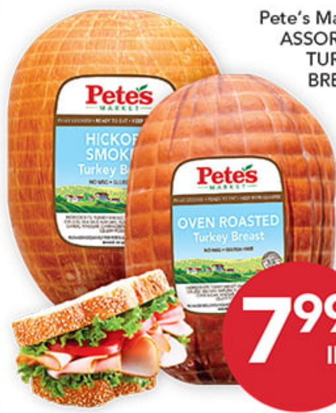
Pete's Market ASSORTED TURKEY BREAST