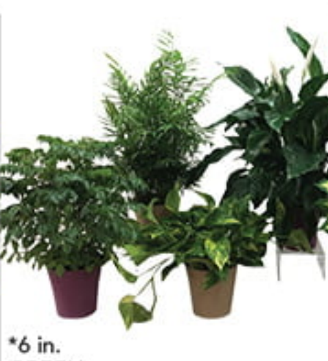
*6 in. GREEN INDOOR PLANTS Assorted