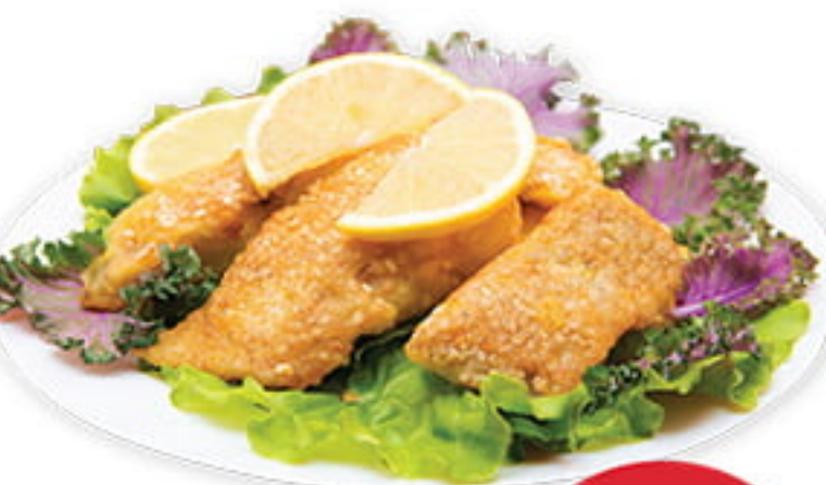
Fresh WHOLE CATFISH Cut in Steaks