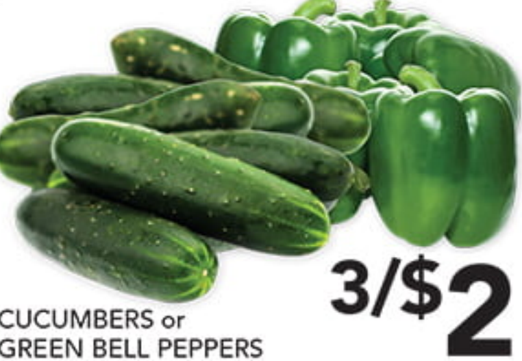
CUCUMBERS or GREEN BELL PEPPERS