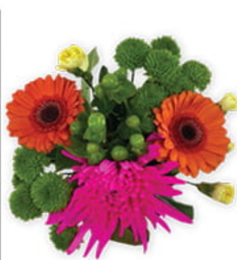
*Cheerful Day BOUQUET