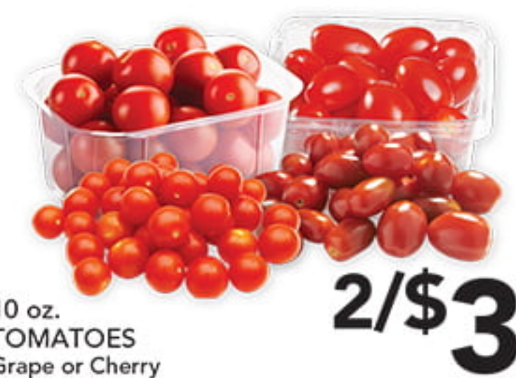
10 oz. TOMATOES Grape or Cherry