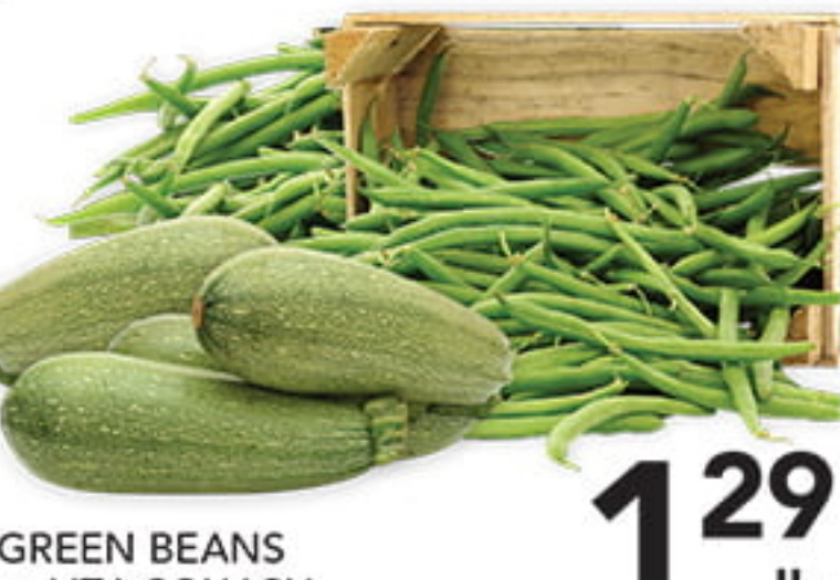
GREEN BEANS or LITA SQUASH