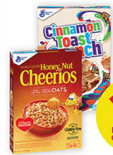
8.9-12 oz. General Mills CEREAL Select