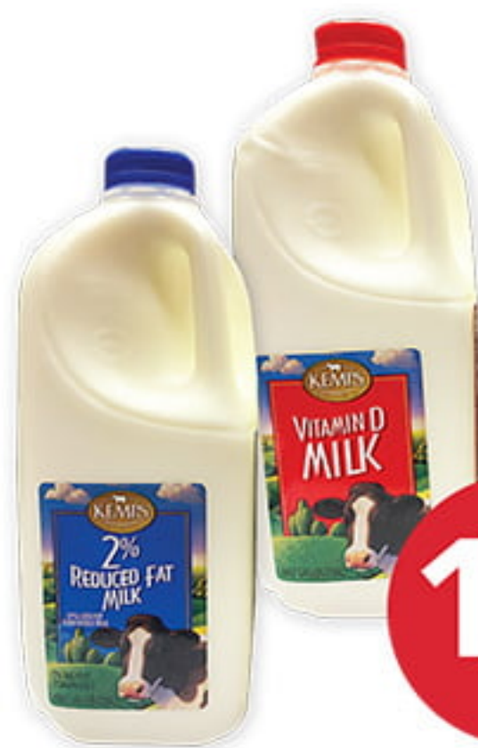
64 oz. Kemps MILK Whole, 2%, 1%, or Skim