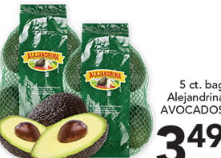
5 ct. bag Alejandrina AVOCADOS