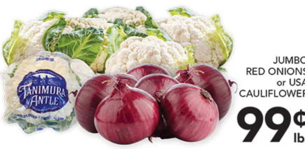
JUMBO RED ONIONS or USA CAULIFLOWER