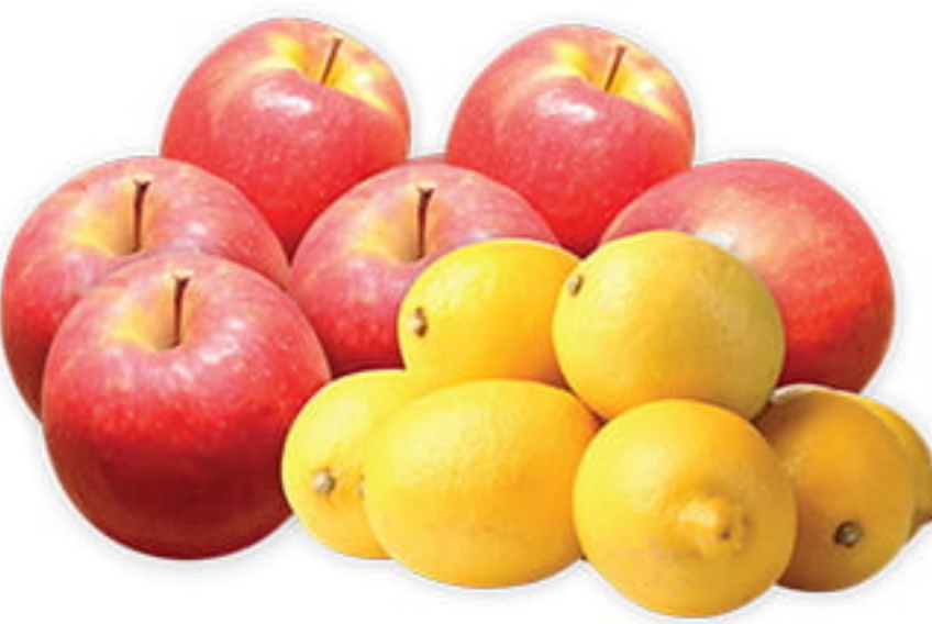
Washington PINK LADY APPLES or LARGE LEMONS