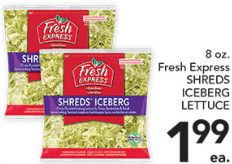
8 oz. Fresh Express SHREDS ICEBERG LETTUCE