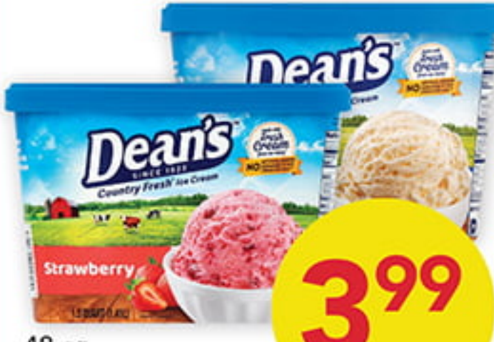
48 oz. Dean's ICE CREAM