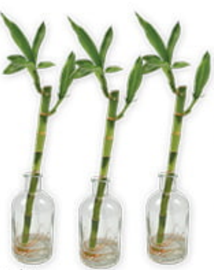
*Lucky BAMBOO PLANT with Vase

*Not available at all stores. While supplies last.