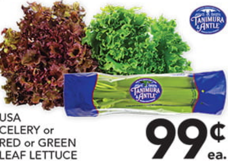
USA CELERY or RED or GREEN LEAF LETTUCE