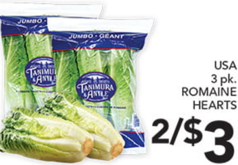
USA 3 pk. ROMAINE HEARTS