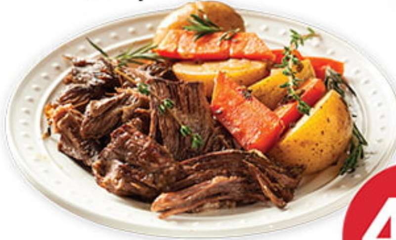
Certified Angus Beef® Boneless POT ROAST Sold in Twin Pack