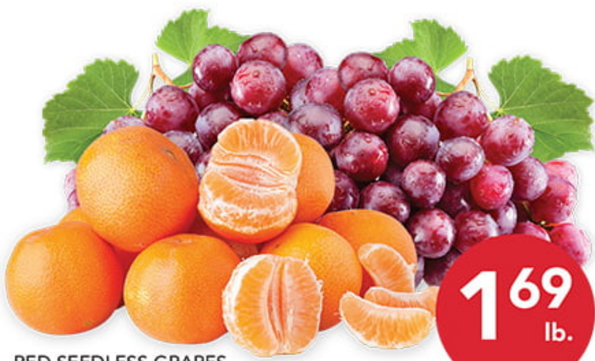
RED SEEDLESS GRAPES OR LOOSE CLEMENTINES