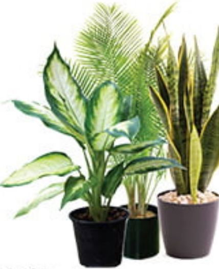
*8-10 in. TROPICAL PLANTS Assorted