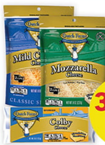
8 oz. Dutch Farms CHEESE Shredded or Chunk