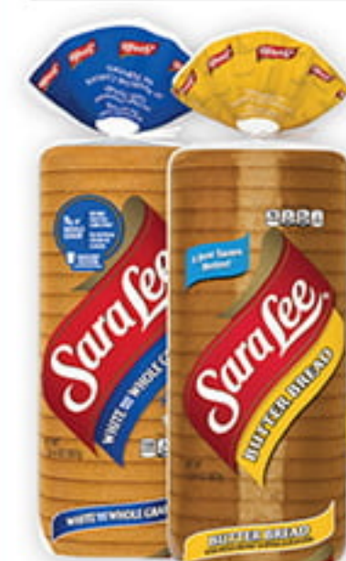
Sara Lee 20 oz. BREAD Whole Grain White, 100% Whole Wheat, Butter Bread, or Honey Wheat